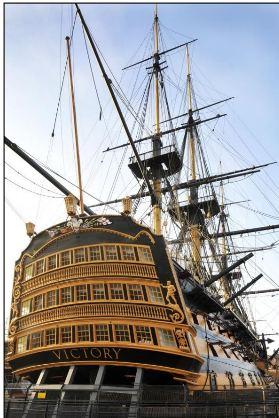
The Wooden Walls. Nelson's Flagship built 250 years ago in 1765

Other major anniversaries this year have celebrated the struggle to defend those founding principles. For generations of schoolboys their two outstanding heroes were the Duke of Wellington and Admiral Lord Nelson.