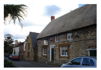
Wooden Walls pub

Regular services and the continuity of church work has been maintained with the help of the Church Wardens and Parochial Church Council. The creation of the 'Friends' fundraising group has raised extra finance to help maintain the church fabric.